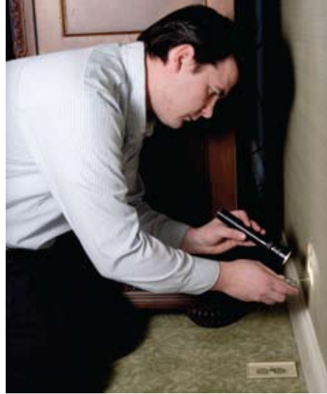
Treatment of infested – and potentially infested – areas helps ensure immediate eradication.