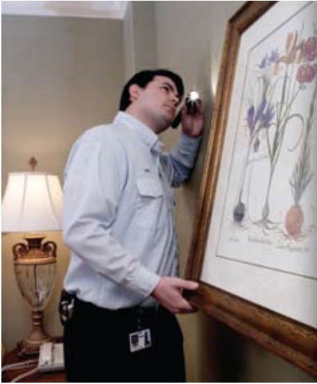
Thorough inspection of infected rooms locates bed bug harborage sites.