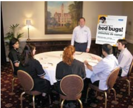
Our “Teaming up Against Bed Bugs” training materials reduce the risk of infestations by teaching staff proper inspection procedures and protocols.